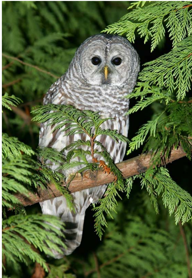
Barred Owl perched in a cedar