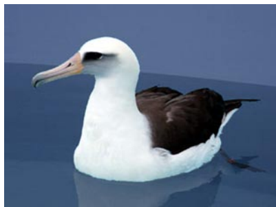
Laysan Albatross ( Phoebastria immutabilis )